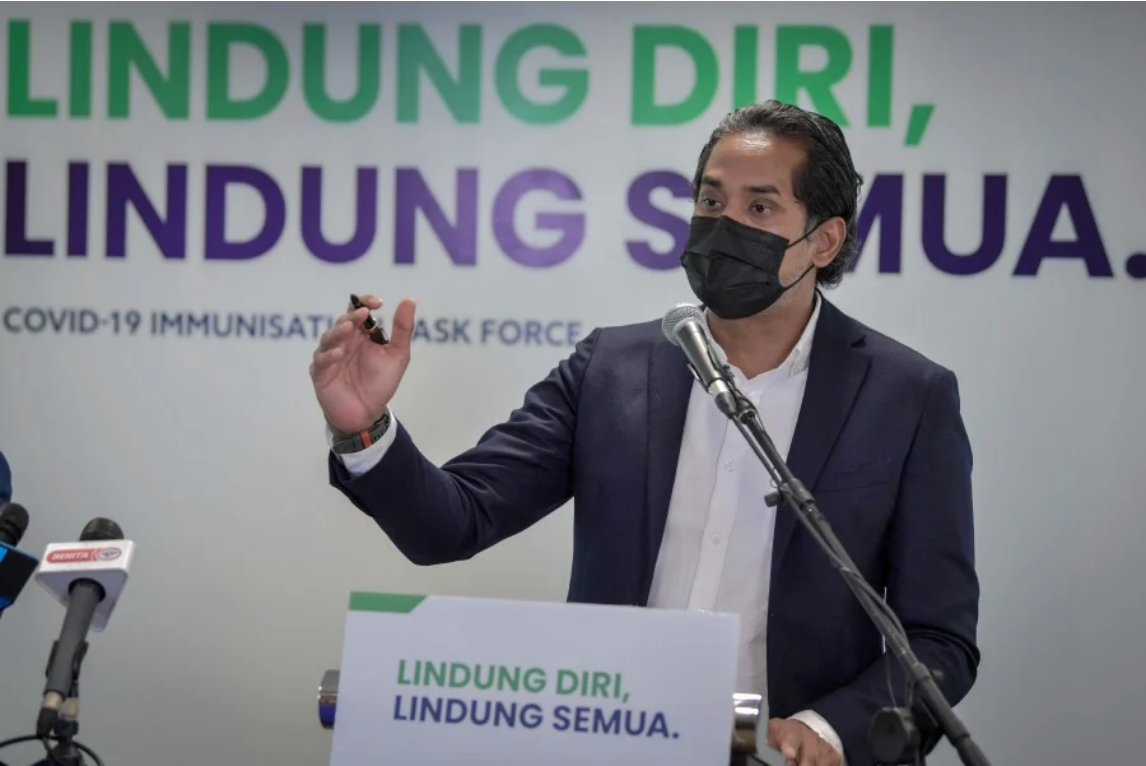
Coordinating Minister for the NIP Khairy Jamaluddin said among the matters being looked into by the special committee was whether to allow those who received their appointment under the NIP to opt out.

NATION Jun 9, 2021 @ 6:11pm 2020 SPM students can download results online starting 10am tomorrow